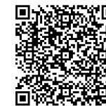
Latest Tide Table